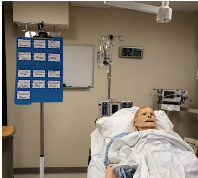
Figure 1 Photograph of a mock simulation laboratory using the Orchestra Leader’s chart, with roles displayed, mounted on an IV pole at the head of the manikin and clearly visible to the entire group.

As the ER nurse called out each role and the student’s name, the student, who had picked the role, stepped up to play it. The Orchestra Leader’s chart served as an easily visible organizational tool during the simulation laboratory