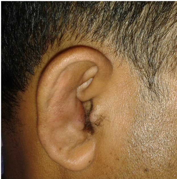
Figure 2 Diffuse auricular pseudocyst involving the concha and scaphoid fossa.

case of auricular seroma there is collection of the fluid above the perichondrium that is in the hypodermis region. The anatomical location of the fluid is usually not mentioned in many studies. It has been said that the intracartilaginous location of the pseudocyst is made apparent by incision as there is a distinct gritty sensation felt when incising through the fibrotic cartilaginous wall of the pseudocyst. 10 This sensation can be missed with needle aspiration. Hence, it may be difficult to determine the exact anatomical site clinically. Thus, the invasive procedures requiring incision of the pseudocyst and the subsequent histological examination of the specimen should be carried out to determine the location of the fluid.