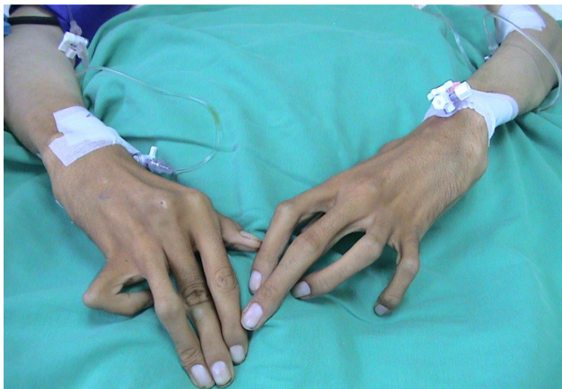
Figure 1 Patient's abnormally long and slender fingers (arachnodactyly).

Invasive arterial monitoring was conducted preoperatively from the radial artery in case prophylaxis to prevent endocarditis and aspiration pneumonia was applied. Due to the risks presented by the skeleton and pulmonary anomaly, central venous catheterization was applied from the left femoral vein with the help of local anesthesia. Two vascular accesses were opened and, as one of these was used for anesthesia induction, nitroglycerine infusion was started from the other vascular access in order to repress/prevent