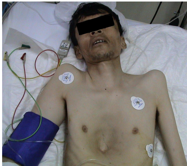
Figure 2 Pectus excavatum observed in the patient.

During the preoperative laboratory examination no other pathology was detected besides leucocytosis ( 15.8 \times 10^9/L ), CRP elevation (15.6 mg/dL), and albumin decrease (33 g/L). Preoperative blood gas values were in the normal range. A moving and soft tissue structure (connection with decreasing aortic dissection) disturbing phleb of the aorta lumen inside the composition of thoracic descendent aorta and abdominal aorta was observed in the abdominal ultrasonography. However, no findings to support the presence of acute aorta dissection were found in tomographic examination.