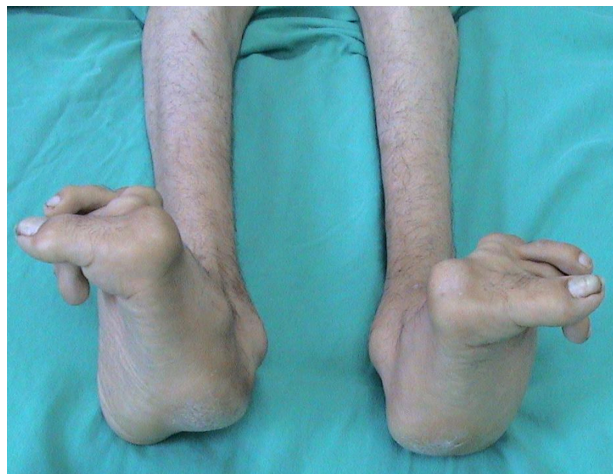
Figure 3 Severe pes planus (talipes calcaneovalgus).