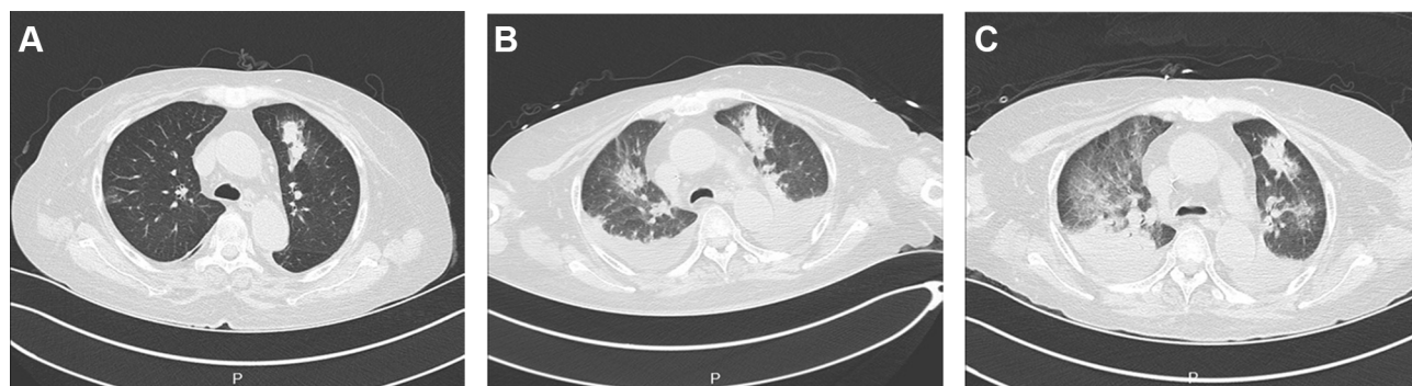
Figure 1 The chest CT showed nodules and patches in the upper lobe of the left lung on admission (A); enlarged lesions in the upper lobe of both lungs and bilateral pleural effusions were observed on the 13th day after admission (B); bilateral infiltrates, interstitial infiltrates, alveolar infiltrates and bilateral pleural effusion were observed on the 20th day after admission (C).

The purulent secretions were cultured on Sabouraud dextrose agar (SDA) (Emmon's modification) and on SDA with chloramphenicol at 28°C. The fungus grew at 28°C on SDA