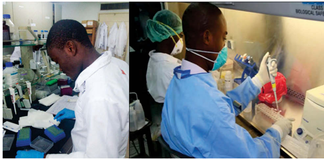
Figure 1 Students working in laboratories at the Noguchi Memorial Institute of Medical Research.

research; junior members and students also had the opportunity to ask questions and learn from the deliberations that occurred." Figure 1 shows students working in laboratories at NMIMR during this internship.