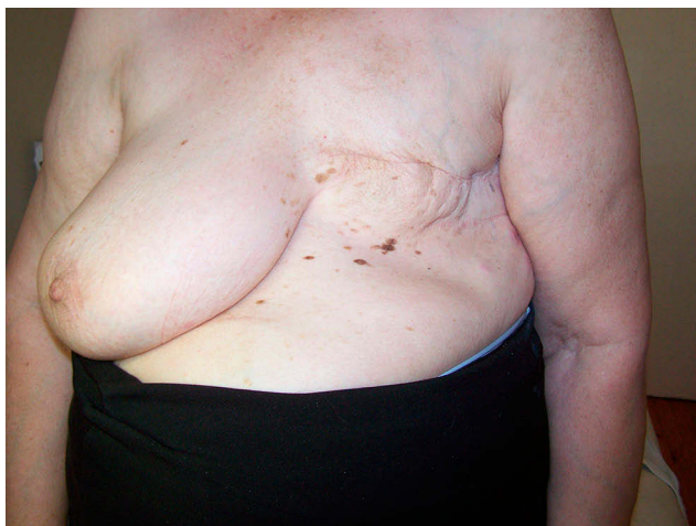
Figure 1 Front picture of the mastectomy.