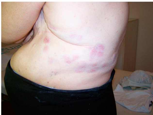
Figure 2 Left side of the body.

During palpation, one plaque was elevated with higher peripheral borders without central ulceration (Figure 3). Due to her medical history, there was no differential diagnosis issue, although the granuloma annulare was a possible alternative diagnosis. Histological examination of the skin biopsy, performed on the abdominal lesion, revealed an intact epidermis and a diffuse infiltration of the dermis by tumor cells. The immunohistochemical test was positive for cytokeratin 7 and ceb-2 , indicating a breast adenocarcinoma. Three phase bone scintigraphy and Computed Tomography scans (abdominal and retroperitoneal) showed no pathological findings. Blood test examinations were also normal. Carcinoembryonic antigen and antigen 15–3 were both normal.