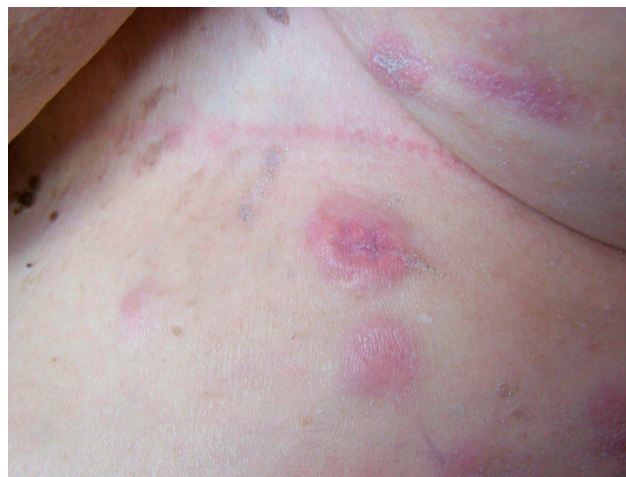
Figure 3 Plaques of the skin.