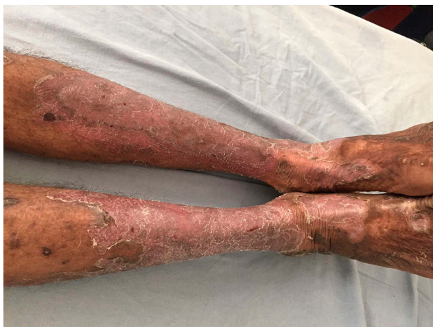
Figure 6 Disappearance of lesions of NAE (refer Figure 5 ) after oral Zinc therapy.