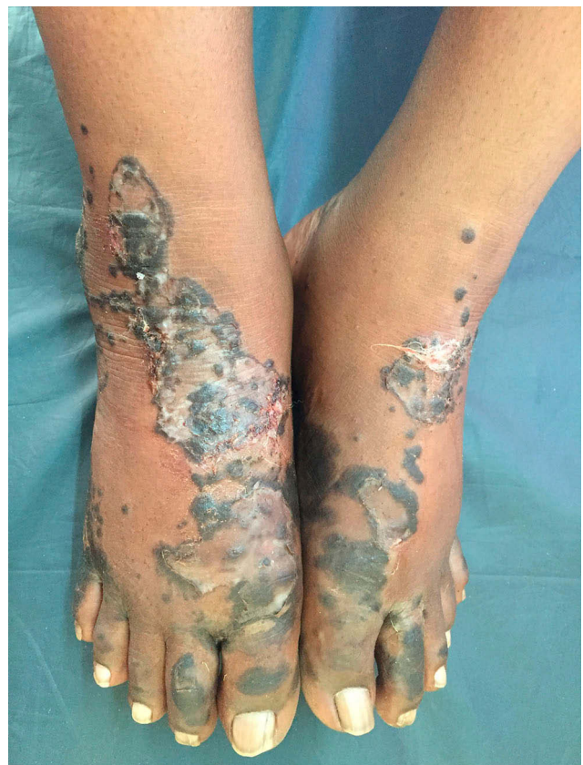
Figure 2 Initial lesions showing well demarcated papules and plaques with dark scales with erosions and edema.

The lesions of NAE evolve in three stages, initial, well developed and late. In the initial stage, scaly erythematous papules/plaques appear with characteristic dusky or eroded centre (Figure 2). In the well-developed stage, the lesions coalesce to form well demarcated thick hyperpigmented plaque with adherent scales (Figure 3). There may be occasional pustules. The lesions become more circumscribed, thin and hyperpigmented in late stage (Figure 4). 17 The lesions typically demonstrate a natural course of spontaneous remission and relapse. 12