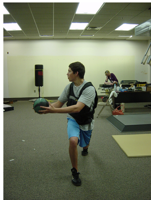
Figure 9 Forward lunge-trunk rotation with weighted vest and medicine ball.