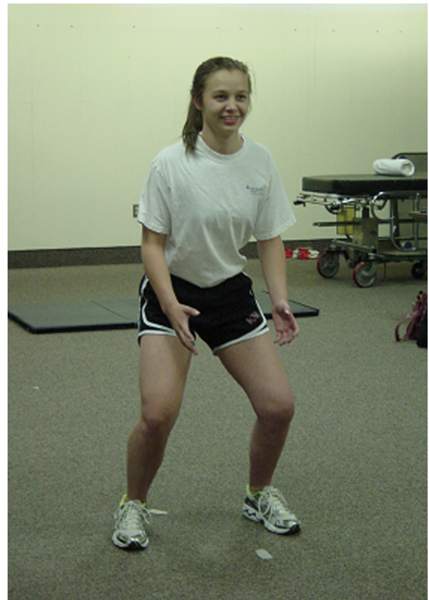
Figure 4 The “athletic ready position”.

Routine presentation and maintenance of an “athletic ready position” with slight to moderate hip and knee flexion and ankle dorsiflexion with the mean centers of plantar pressure aligned near the middle of each foot rather than over the heels or toes is essential to prevent knee reinjury (Figure 4). During jump landings, the head should be erect with the eyes looking forward and the body center of mass should be lowered via controlled hip and knee flexion (not increased trunk flexion with concomitant hip and knee extension) within an approximately shoulder-width base of support. The postural alignment strategy that the patient uses during athletic movements is a potentially modifiable knee injury risk factor. Patients should learn appropriate athletic movement technique in a methodical slow-to-fast progression, first developing consistent alignment before progressing to high-speed, high-intensity performance. A well-designed neuromuscular training program can help decrease this risk. 18 The educational goal is to develop the