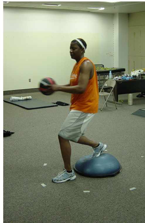
Figure 8 Matrix exercise with Bosu ball and medicine ball.

and transverse plane lower extremity control. 74 When an orthotic is needed, a good pair of over the counter supports will generally suffice.