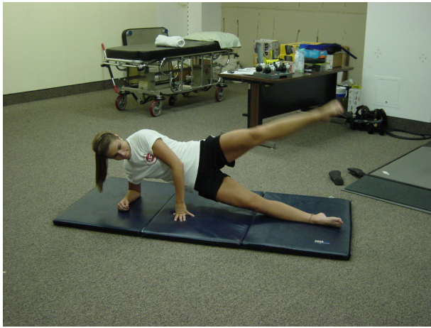
Figure 1 Lateral plank with hip abduction.

without leg lifts (Figure 1). 4 Exercises performed during this time period should focus more on developing efficient neural activation pathways than on increasing muscular hypertrophy. 5 This is particularly true for reestablishing quadriceps femoris neuromuscular activation often with the assistance of electrical muscle stimulation and bio-feedback techniques.