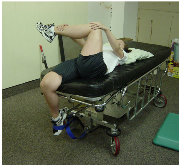
Figure 3 Supine modified Thomas stretch (right side) and piriformis stretch (left side).

small hip external rotators, hip adductors, and hamstrings, can be associated with compensatory overuse and related maladaptive compensations.