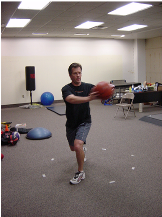
Figure 6 Matrix exercise.