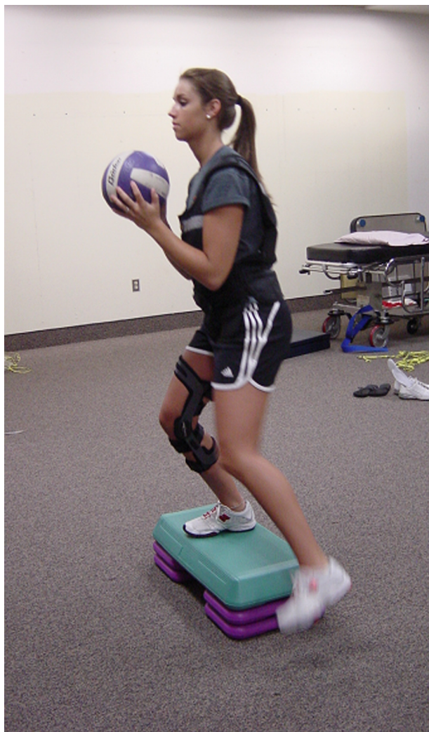
Figure 10 Lateral step-up with weighted vest and volleyball press.

can be used to increase the motor control challenge, and a variety of sports equipment such as boxing gloves, balls, sticks, racquets, or dumbbells can increase trunk, upper extremity, and lower extremity integration requirements. Proficiency with Matrix exercises, lateral lunge with trunk rotation, forward lunge with trunk rotation (Figure 9), lateral elevated stepping (Figure 10), heading a stability ball during single-leg stance on a Bosu ball (Figure 11), and Woggler walking (Figure 12) are low-impact methods of developing integrated hip-knee-ankle function before progressing to hopping and jumping (Figure 13). As with the Matrix exercise, a weighted vest can be used to progressively increase vertical loads, but never at the expense of faulty technique, poor alignment, or otherwise reduced movement quality. Long-axis trunk-lower extremity rotation on the Ground Force 360 device (Center of Rotational Exercise, Inc., Clearwater, FL, USA) (Figure 14) uses pro-