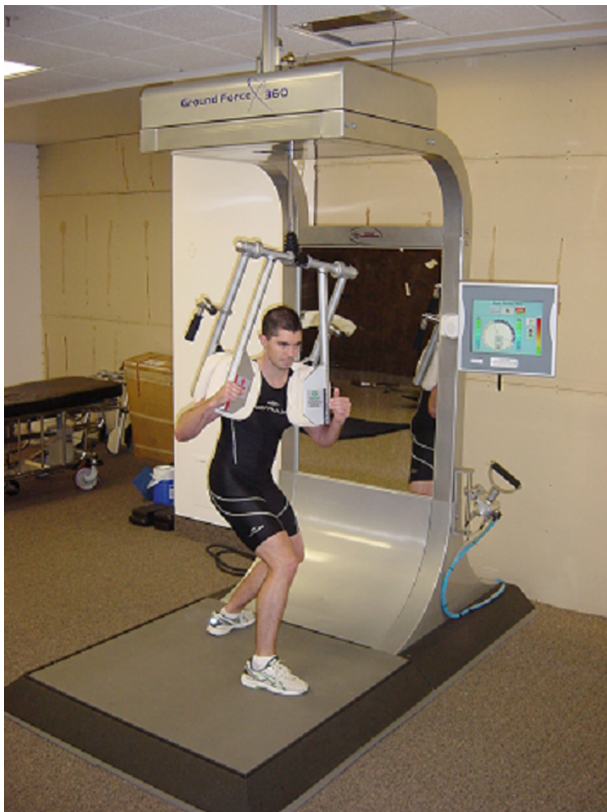
Figure 14 Long-axis rotation with progressive concentric and eccentric resistance on the Ground Force 360 Device.

gressive speed, concentric and eccentric resistances, and range of motion to simulate athletic movement challenges. The Ground Force 360 device provides a unique environment to train composite trunk, core, and lower extremity neuromuscular control, while the rehabilitation clinician monitors postural alignment and movement coordination. The rehabilitation clinician must remember that ultimately the reconstructed knee should be able to safely withstand repetitive loads in excess of 5 times the force of gravity during single-leg jump landings. 54