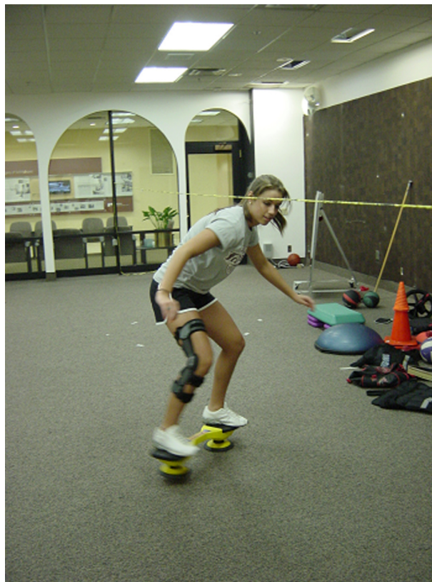
Figure 12 Diagonal Woggler walking under a high positioned tape.