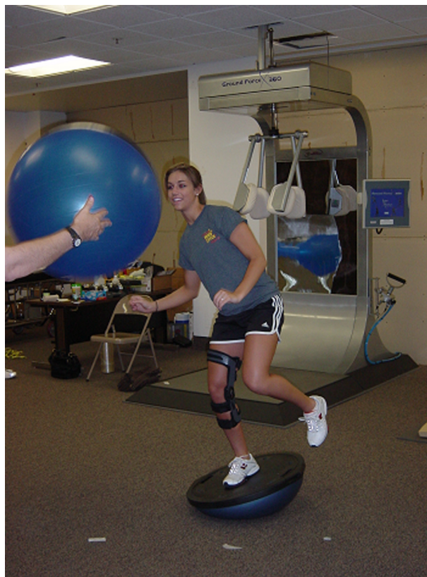
Figure 11 Single leg balance on Bosu ball while heading a stability ball.

can be used to increase the motor control challenge, and a variety of sports equipment such as boxing gloves, balls, sticks, racquets, or dumbbells can increase trunk, upper extremity, and lower extremity integration requirements. Proficiency with Matrix exercises, lateral lunge with trunk rotation, forward lunge with trunk rotation (Figure 9), lateral elevated stepping (Figure 10), heading a stability ball during single-leg stance on a Bosu ball (Figure 11), and Woggler walking (Figure 12) are low-impact methods of developing integrated hip-knee-ankle function before progressing to hopping and jumping (Figure 13). As with the Matrix exercise, a weighted vest can be used to progressively increase vertical loads, but never at the expense of faulty technique, poor alignment, or otherwise reduced movement quality. Long-axis trunk-lower extremity rotation on the Ground Force 360 device (Center of Rotational Exercise, Inc., Clearwater, FL, USA) (Figure 14) uses pro-