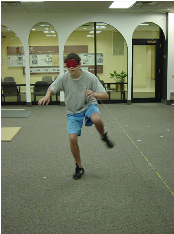
Figure 13 Blindfolded lateral single leg hop and stabilization over a low positioned tape.