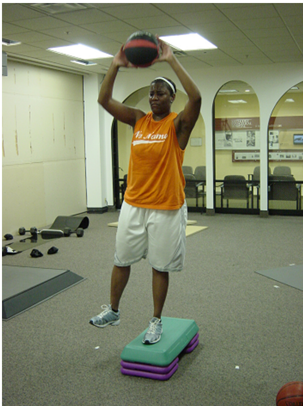
Figure 5 Lateral step-up with medicine ball press.

We have found that the single leg press exercise is a useful method to determine composite single lower extremity strength. Side-to-side comparison of six progressive resistance sets performed with each lower extremity independently for 12, 12, 10, 10, 8, and 8 repetitions can help determine the patient's capacity for safely handling 1 g loads before progressing to the multiple g's associated with higher impact activities. The noninvolved lower extremity goes first with progressively increasing resistance