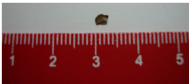
Figure 2 Foreign body removed from lens. It was about 2 \times 2 mm in size.

Currently there are many tools available to aid in diagnosis of IOFBs, including plain X-ray, ultrasonography, optical coherence tomography, anterior segment optical coherence tomography (ASOCT), ultrasound biomicroscopy, computerized tomography (CT) scanning, and magnetic resonance imaging. Radiography is not an optimal diagnostic