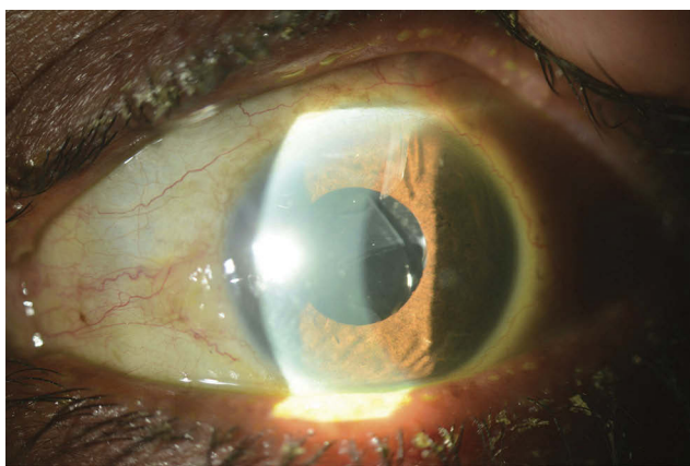
Figure 3 Slit-lamp photograph demonstrating the presence of a 1-piece acrylic intraocular lens in the ciliary sulcus space, resting on the anterior capsule. Mechanical iris chafing caused by the malpositioned intraocular lens resulted in pigmentary glaucoma that required aqueous shunt implantation.

When the question of whether a SPA IOL should be placed in the ciliary sulcus was presented at the Spotlight on Cataract Complications Symposium at the 2008 American Academy of Ophthalmology annual meeting, 47% of the respondents said “never”, 40% said “yes, if capsule support