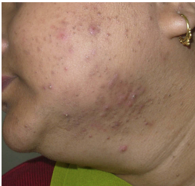
Figure 1 Inflammatory papules, deep-seated nodules and comedones on the lower cheek, mandibular area, extending to the neck in an obese perimenopausal woman.

macrocomedones in the frontal and side regions of the face is usually seen in patients beyond 40 years and in smokers (Figure 2). 19 Another variant described in menopausal acne is the presence of multiple closed comedones visible on stretching the skin, along with enlarged pores in the nasal and malar areas. 31 In elderly patients (>60 years), acne has a predominant truncal distribution and is often resistant to