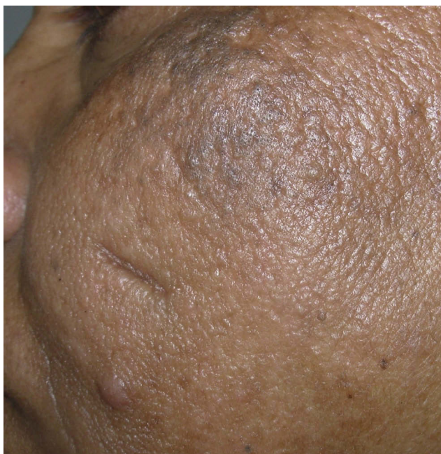
Figure 2 Multiple comedones on the upper cheek and a solitary inflammatory papule.

macrocomedones in the frontal and side regions of the face is usually seen in patients beyond 40 years and in smokers (Figure 2). 19 Another variant described in menopausal acne is the presence of multiple closed comedones visible on stretching the skin, along with enlarged pores in the nasal and malar areas. 31 In elderly patients (>60 years), acne has a predominant truncal distribution and is often resistant to