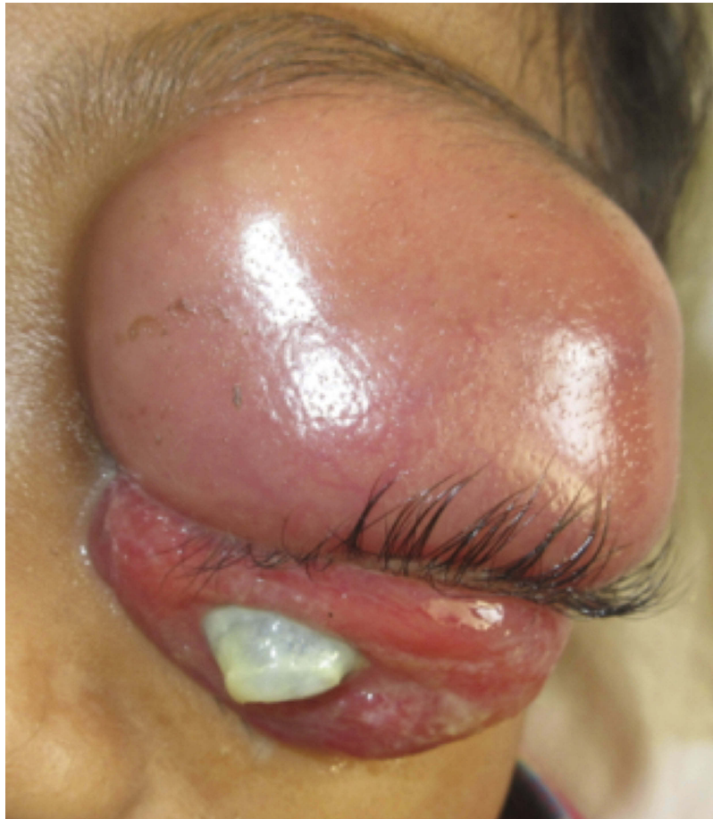
Figure 1 Baseline clinical presentation of left eye shows uniaxial proptosis with marked palpebral edema and conjunctival chemosis. Note the corneal ulcers.

A multislice computed tomography (MSCT) scan showed lesions involving the lateral orbit (Figure 2A)