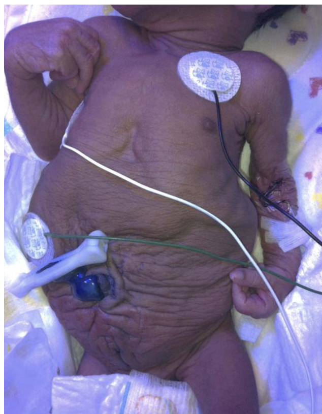
Figure 1 Appearance of a newborn with PBS: wrinkled, redundant skin with bulging at the flanks due to deficient of abdominal wall musculature.