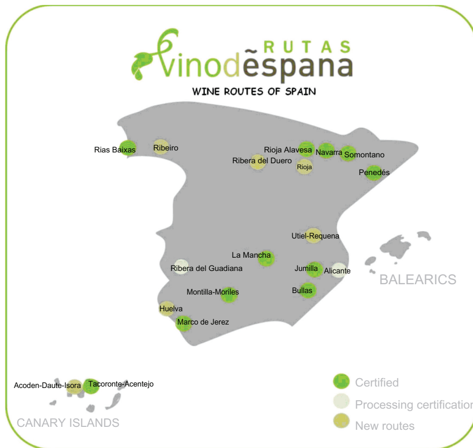
Figure 1 Wine tourism product club: The Wine Routes of Spain. 4

In 2008, the number of visitors to wineries associated with wine routes in Spain amounted to 1,198,199 (Figure 2). The route with 14 of the most visitors was the Wine and Cava Route of Penedès (Oenotourism Penedès) with 457,896 visitors. The second highest number of visitors was to the Wine and Brandy Route of Marco de Jerez (434,161 visitors). We should comment in this regard that both these oenotourism areas have some of the most visited wineries in the world such as Codorniu and Freixenet in Penedès, or Gonzalez Byass Tio Pepe at Marco de Jerez, which have over 100,000 annual visitors. Other routes that have obtained relevant figures are Rioja Alavesa (80,688 visitors), Utiel-Requena (47,496 visitors), and Somontano (46,099 visitors). These totals do not include statistical data from the associated wineries of the Wine Route of Rioja Alta, which will undoubtedly receive outstanding numbers of visitors.