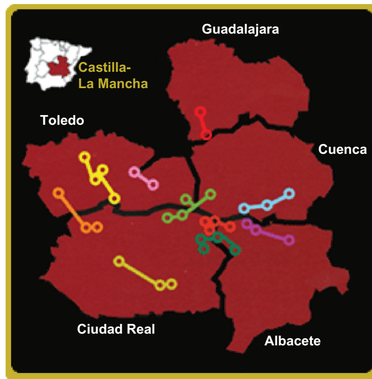
Figure 4 Wine tourism product club Divinum Vitae (Castilla-La Mancha). 3