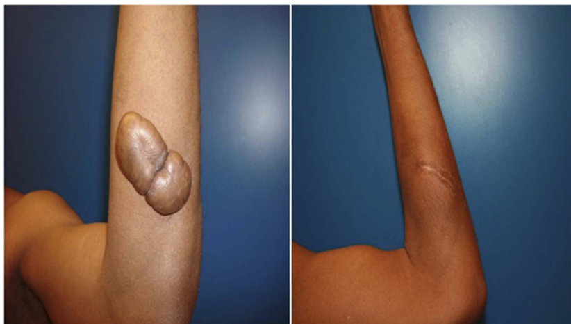
Figure 5 Forearm keloid. Before and after treatment result at 2-year follow-up.