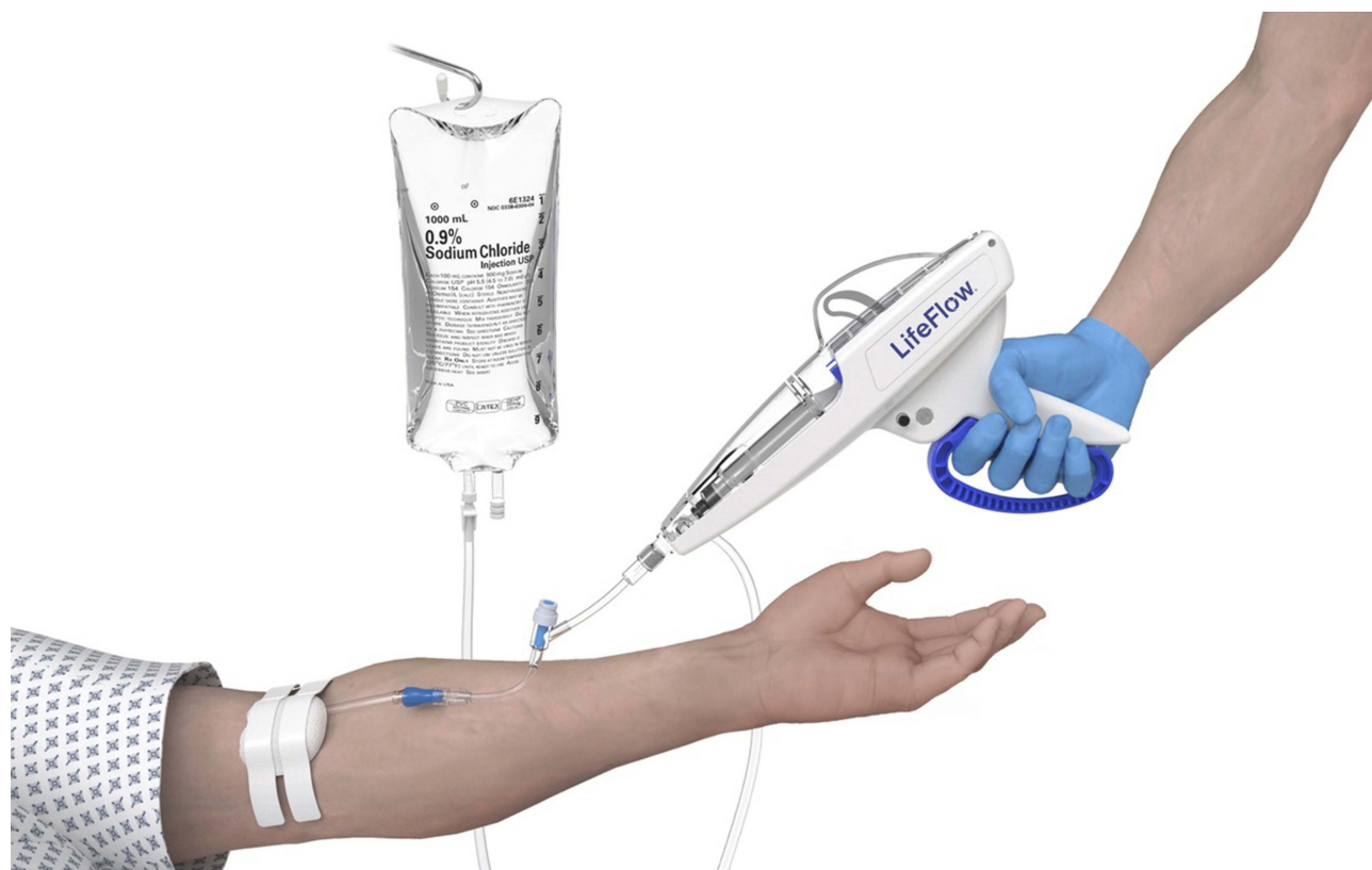
Figure 1 LifeFlow® device.

In a recent study of LifeFlow at Yale New Haven Children's Hospital, teams of providers were asked to treat a simulated 10 kg patient with septic shock. For the fluid resuscitation element of the scenario, teams were randomized to LifeFlow, PPT, and pressure bag for the delivery of three 20 mL/kg boluses of fluid. Completion of the 60 mL/kg of fluid was fastest with the LifeFlow device, and participants judged the complexity of fluid delivery to be the lowest with LifeFlow, as measured by