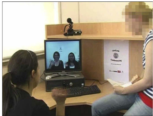
Figure 1 The experimenter (right) introducing the participant (left) to two female students (prerecorded confederates) at the beginning of the experimental interaction.

Although the paradigm has the appearance of a real web-based interaction, the other students are actually actors whose actions have been pretaped. Confederates give their accounts sequentially such that in all conditions, the two confederates speak for approximately 90 s each, and the participant gives