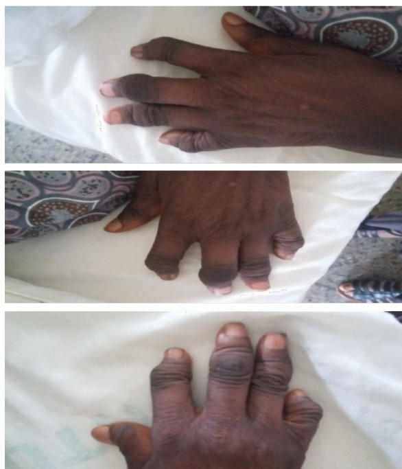
Figure 1 Arthritis mutilans of both hands.

Laboratory data revealed a hemoglobin level of 10.0 g/dL, hematocrit of 30%, and white blood cell count of 4,300/mm 3