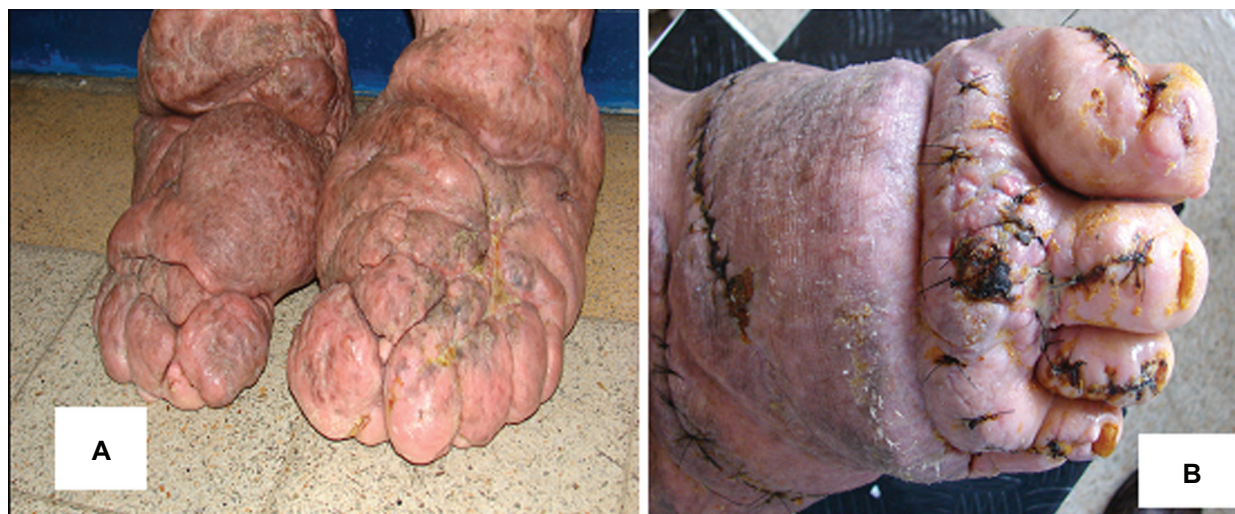
Figure 1 Before and after reconstruction surgery of the foot and toes.

and leg. This stocking was developed, after studies by the authors, using a material which in Brazil is called gorgurão. 11 This material is a mixture of 50% cotton and 50% polyester and thus has the characteristics of being low stretch and inexpensive; this is important as most of the patients have low incomes. For personal hygiene, the stockings can be put on and removed by the patient and thus provide independence. The stockings are made similar to commercial made-to-measure stockings with Velcro or hook-and-eye fasteners being used so that the patient can adjust the size and thus the pressure exerted by the garment. A reduction in the size of the thighs and feet was obtained, however deformities of the feet made the use of compression and shoes difficult. Thus the patient was submitted to surgery to remove deformities