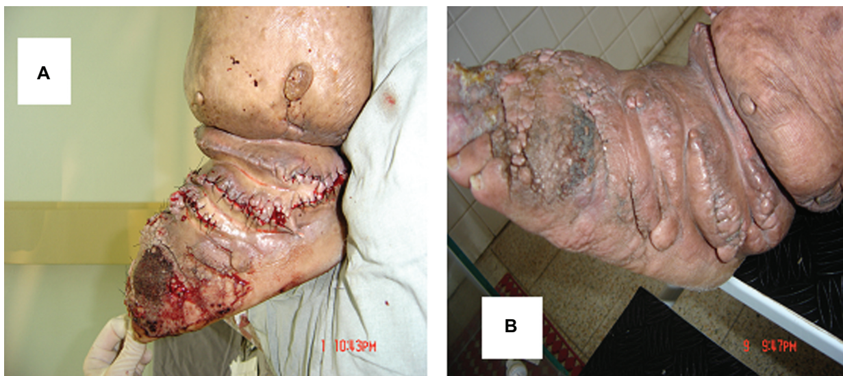
Figure 4 The immediate postoperative period after resection of 2970 grams of tissue and three months after surgery.

The current report shows the clinical experience of removing large lymphedematous deformities from the feet. The most important aspect of this approach was the maintenance of the integrity of the skin with resections being performed to remodel the feet in order for compression therapy to be possible. The initial clinical treatment allowed a reduction