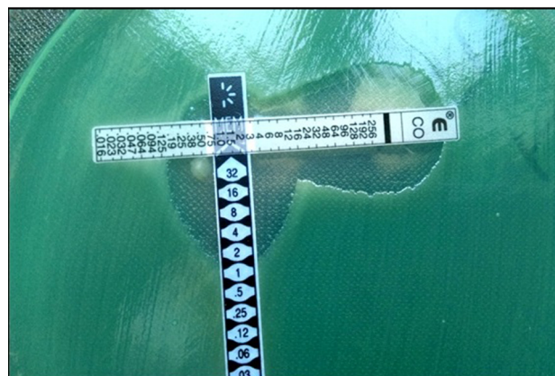
Figure 2 Colistin/meropenem combination test ( Pseudomonas aeruginosa ). Notes: The MIC of colistin was 0.75 µg/mL when tested alone but was 0.25 µg/mL when tested in combination. The MIC of meropenem was >32 µg/mL when tested alone but was 2 µg/mL when tested in combination. This was a synergistic effect (isolate no. 1; Table S2).

Abbreviation: MIC, minimum inhibitory concentration.