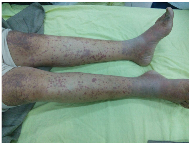
Figure 1 Bilateral purpuric lower limb skin lesions due to HCV-MC-induced vasculitis in one of the included patients.

Abbreviation: HCV-MC, hepatitis C virus mixed cryoglobulinemia.