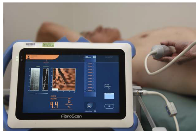
Figure 3 A patient undergoing TE using FibroScan 430 mini (Echosens, Paris, France). TE median of 10 measurements – 4.4 kPa, IQR =0.3. Abbreviations: IQR, interquartile range; TE, transient elastography.

The transducer is positioned over the right 9th, 10th, or 11th intercostal space to measure the elasticity of the right lobe of the liver (Figure 3). Sampling error can be reduced by varying the position of the transducer. 49 However, it is important to note that the final measurement does not represent the entirety of hepatic tissue. The presence of ascites and significant adipose tissue interferes with shear wave propagation, and these are important limitations of TE. In a prospective study of more than 2,000 liver stiffness measurements, TE had a failure rate of 4.5%. 50 In multivariate analysis, increased BMI was the only factor positively associated with failure (although this study excluded patients with