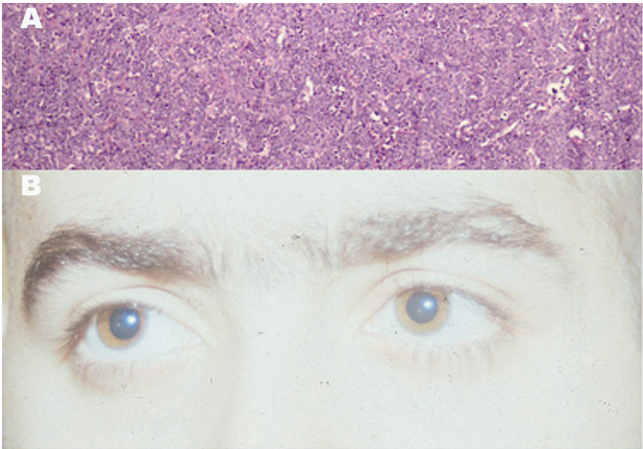
Figure 1 (A): Lymph node biopsy: Showing the typical 'Starry sky appearance' seen in Burkitt's lymphoma. (B): Primary gaze: Showing right eye hypertropia. Size of the pupil 3 mm.

The CSF tested negative for cryptococcal antigen and Venereal Disease Research Laboratory (VDRL) test, with no growth on bacterial and fungal cultures. Subsequent bone marrow biopsy and HIV testing were also negative. Based on elevated opening pressure and the presence of hydrocephalus on neuro-imaging, the patient underwent ventricular-peritoneal shunting. Despite improvement in the hydrocephalus, ten days after the shunting procedure the patient developed diplopia for which the ophthalmology service was consulted.