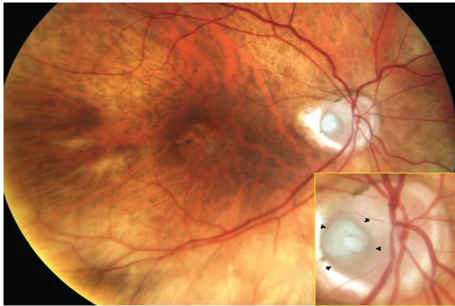
Figure 1 Color fundus photograph of the right eye, depicting an optic nerve pit with peripapillary atrophy. Mild pigmentary changes are present in the macula. Arrow heads point to the margins of the pit.

(Spectralis; Heidelberg Engineering) imaging in the area of retinal thinning (Figure 3B). MP-1 (Nidek, Gamagori, Japan) revealed significant reduction in threshold in this region, with preserved function at the fovea and sparing of retina superiorly (Figure 3C).