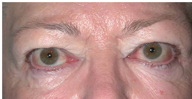
Figures 5 (left) and 6 (right) Pre- and post-operative orbital decompression images document a marked decrease in proptosis.

for optic neuropathy. Proptosis has expanded as a surgical indication to include decompression for cosmesis; and decompression is often utilized to provide relief of congestion. Orbital decompression involves either removal of or thinning of any combination of orbital wall surfaces in addition to removal of orbital fat. In bony decompression, additional space is created for soft tissues to prolapse, often into the ethmoid or maxillary sinuses, temporal fossa, and/or cranial cavity. Removal of the inferior wall with the medial, inferomedial and lateral, balanced medial and lateral, and deep lateral wall decompression are common techniques. Alteration of the orbital vault structure can lead to new onset of diplopia.