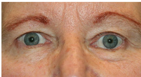
Figures 7 (left) and 8 (right) Pre- and post-operative strabismus surgery images document improvement of motor alignment.