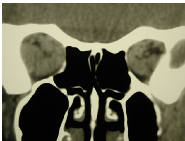
Figure 4 CT imaging of extraocular muscle enlargement at orbital apex.

Patients with Graves’ ophthalmopathy should be managed by a coordinated team of primary care physicians,