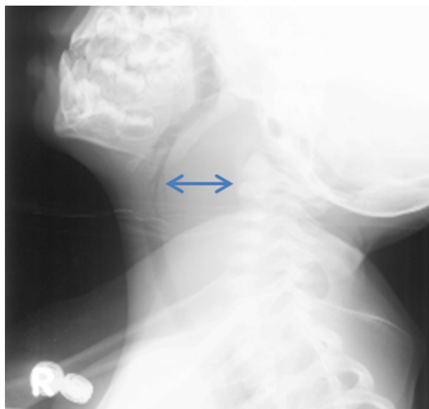
Figure 1 Lateral neck X-ray demonstrating significant retropharyngeal thickening (blue arrow) with anterior displacement of airway.

The necessary airway equipment as well as surgical instruments for tracheotomy was set up prior to the patient entering the operating room. In an attempt to keep the child calm and to avoid any unnecessary manipulation of the airway, he was transported to the operating room in his mother's arms. Anesthesia was induced by slow, controlled inhalation of sevoflurane in nitrous oxide and oxygen with the goal of maintaining spontaneous ventilation. After ensuring an adequate depth of anesthesia and properly