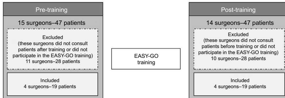
Figure 2 Flowchart that explains the number of surgeons and patients included in the study.

these percentages were 20.0%, 73.3%, and 6.7%, respectively ( p=0.54 ). According to surgeons, 55.6% of the surgeons before training mentioned that the decision was made by them, 38.9% mentioned that the decision was made together with the patient or relatives, and 5.6% mentioned that the decision was made by the patient. After training, surgeons mentioned significantly more often that the decision was made together with the patient (73.7%) and less often that the decision was made by them (15.8%) ( p=0.04 ). A total of 10.5% mentioned that the decision was made by the patient and/or their relatives.