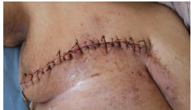
Figure 3 Four days postoperative view of a patient who underwent total mastectomy and axillary clearance by the tumescent technique.

by Worland 16 in 1996, when he observed its successful use in abdominoplasties, but it was reserved for elderly patients and those with poor anesthetic risk, especially those with ASA score III or IV. 5 Although epidural anesthesia, intercostal block, and paravertebral block are used in these situations, all are technically demanding, not free of complications, and still have a failure rate. 15 The