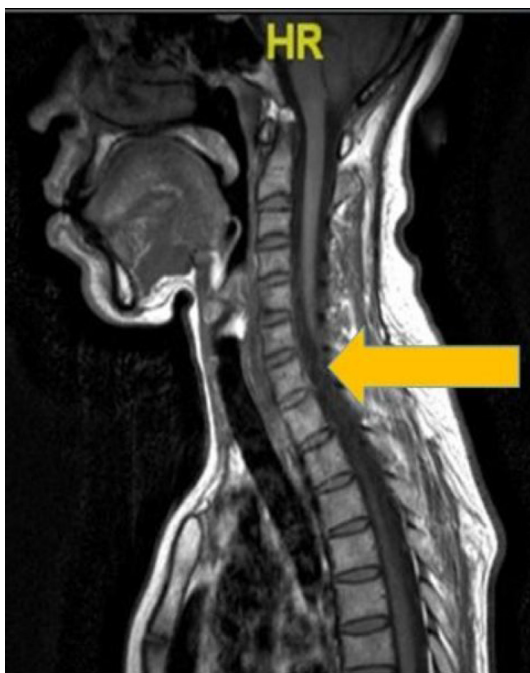
Figure 4 Linear signal hypointensity from T3 to T6 vertebra level on T1 weighted imaging (arrow).

She was diagnosed with syringomyelia with right optic atrophy. She was started on intravenous methylprednisolone at a dosage of 250 mg four times a day for 5 days, followed by oral prednisolone at a dosage of 40 mg (1 mg/kg/day) once daily for 9 days. Her condition improved after 2 weeks of treatment, with reduction in the right eye central scotoma. However, due to the preexisting optic atrophy, visual acuity in her right eye was 6/9. Her optic nerve functions persistently reduced compared to her left eye. She was continued with oral prednisolone with tapering dose weekly. Subsequent follow-up at 1 month after diagnosis showed that her ocular condition