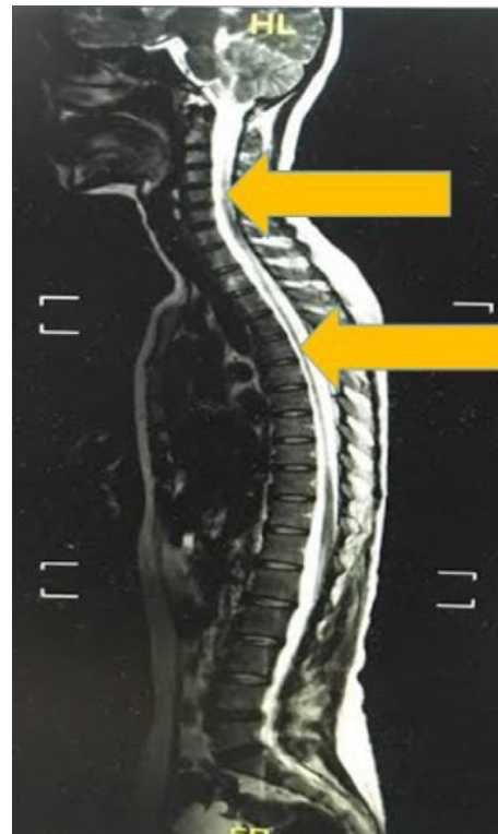
Figure 2 Linear signal hyperintensity from C2 to C6 and T2 to T9 vertebra level on T2 weighted imaging (arrow).

followed by oral prednisolone at a dosage of 45 mg (1 mg/kg/day) once daily for 9 days. Her condition dramatically improved after treatment. Visual acuity of her left eye was 6/24, and her optic nerve functions improved. She was continued with oral prednisolone with tapering dose weekly for another 1 month. Her visual acuity improved to 6/6 with good optic nerve functions. Oral prednisolone was off after 2 months. There was no complication due to the use of corticosteroids. Her vision remained good during 6 months follow-up.