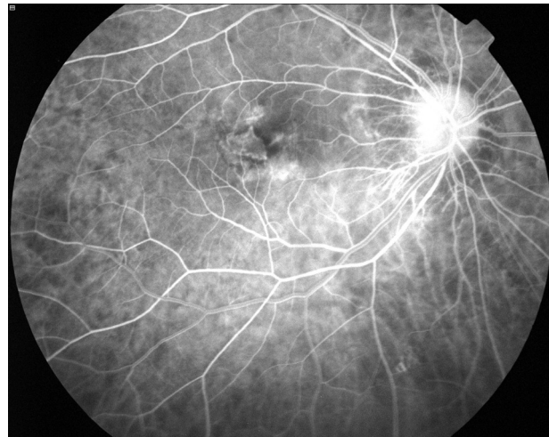
Figure 3 Fundus fluorescein angiography images showing the choroidal neovascular membrane.

et al 1992). In our case it is much debated whether the postoperative inflammation plays an inciting angiogenic role or the removal of the natural blue-light barrier induces the formation of choroidal neovascularization in the predisposed eye (Bradley et al 2005). Ruiz-Moreno et al (2004) suggested that surgical trauma was the cause of the development of CNV after cataract surgery in myopic eyes, while Blair and Ferguson (1979) claimed that the changes in the choroidal hemodynamics allow pre-existing new blood vessels to leak or bleed.