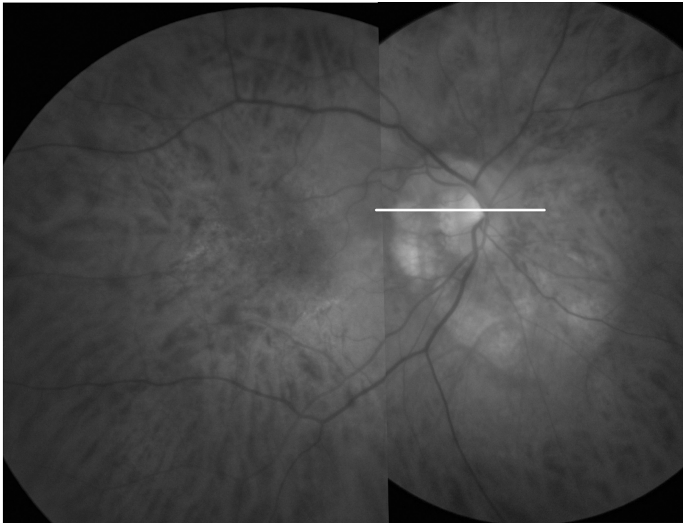
Figure 1 Fundus photography with a line showing the OCT scan. The photograph demonstrates the presence of a tilted disc surrounded by a slightly elevated yellow-orange lesion, consistent with a PPRD, which hampered visualization of the underlying choroidal vessels.

The nonreflective space extended temporally up to 1.1 mm from the fovea. No epiretinal membranes were detected. The scans crossing the optic nerve head confirmed the lack of an optic disc pit. Neither FA nor indocyanine green angiography (ICGA) disclosed any choroidal neovascularization.