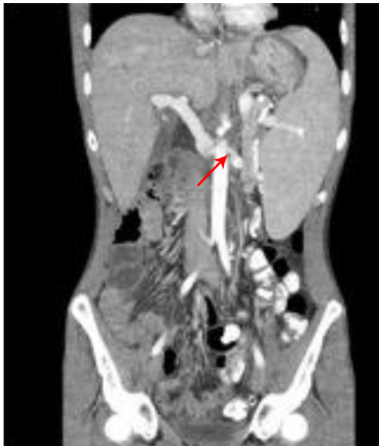
Figure 2 CT scan performed 2 months postoperative. Note: Abdominal CT scan of Case 1 showed the reno-portal vein anastomosis (arrow).

Because of this, a portal revascularization of the portal vein was achieved anastomosing the graft portal vein with the left gastric vein with satisfactory postoperative flow (Figure 3). A CT scan at POD 7 confirmed patency of the anastomosis (Figure 4). The patient was discharged at POD 24 with good liver function (Table 1).