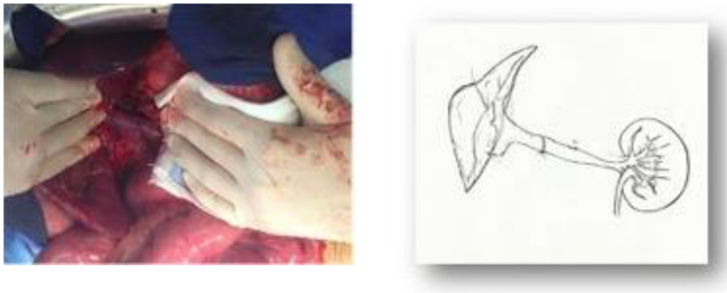
Figure 1 Intraoperative view of the porto-left renal vein anastomosis (left) and schema of the vascular reconstruction (right) in Case 1.