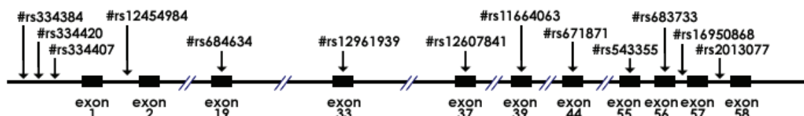
Figure 1 13 SNPs analyzed in the LAMA1 gene. Vertical arrows show the 13 SNPs analyzed in this study with the #rs numbers. Left of the figure is 5' UTR. Black boxes show the translated regions (exons) of this gene with the exon numbers below them.

We screened 13 SNPs within the the LAMA1 gene for all the cases and controls (Figure 1). Seven SNPs localized in the