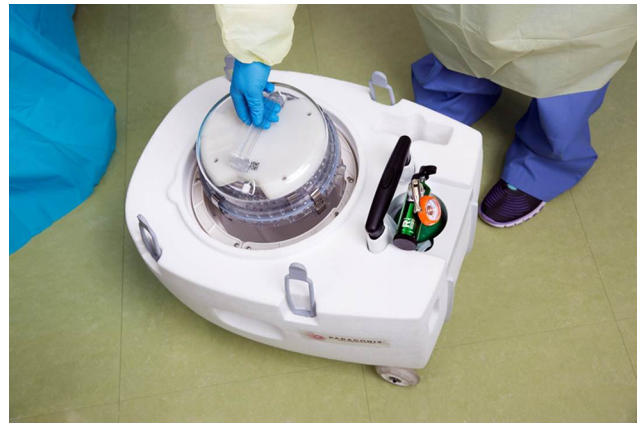
Figure 2 Paragonix Sherpa™ cardiac transport system (Braintree, MA, USA).

rently, only “normothermic” perfusion is used clinically (see Normothermic machine perfusion (NMP) section). There is, however, preclinical experimental data showing that hypothermic oxygenated MP is beneficial for donor hearts.