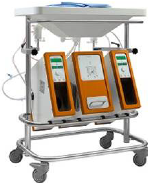
Figure 1 Liver assist (Organ Assist, Groningen, the Netherlands).

Registry data of the International Society for Heart and Lung Transplantation show that ischemia of more than 200 minutes is associated with a higher mortality after heart transplantation. 34 Therefore, it is critical to find ways to protect against longer ischemic times for the heart. Not only would extending the safe ischemic period time permit the transportation of hearts procured from more distant sites, but it could also enable human leukocyte antigen (HLA)-matching between donor and recipient. HLA-matching is not routine in heart transplantation at the moment because of the time constraints, however, it has been shown to improve survival in some reports. 35 Cur-