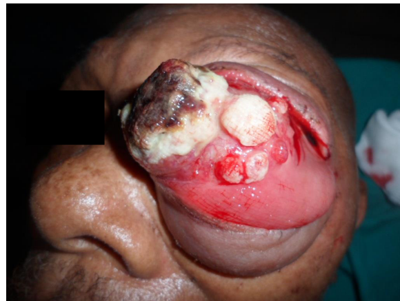
Figure 1 Protrusion of orbital contents.