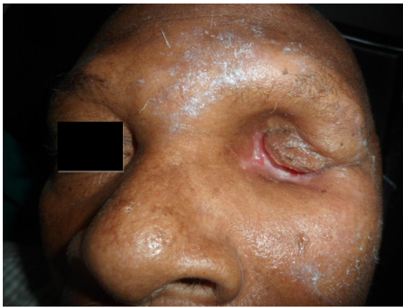
Figure 4 Spontaneous healing of the orbital cavity.

at presentation. A low CD4 + cell count and other immunosuppressive states like diabetes and intravenous drug abuse are predisposing factors for orbital involvement with malignancies in AIDS. 10 All the patients reported to our hospital at an advanced stage of their illness, and OE was the only therapeutic option. Preoperatively, an orbital CT scan revealed no bony destruction and no intracranial invasion in all the patients. Orbital imaging using CT and magnetic resonance imaging give the exact characteristics of the tumor extension and structures involved. 11