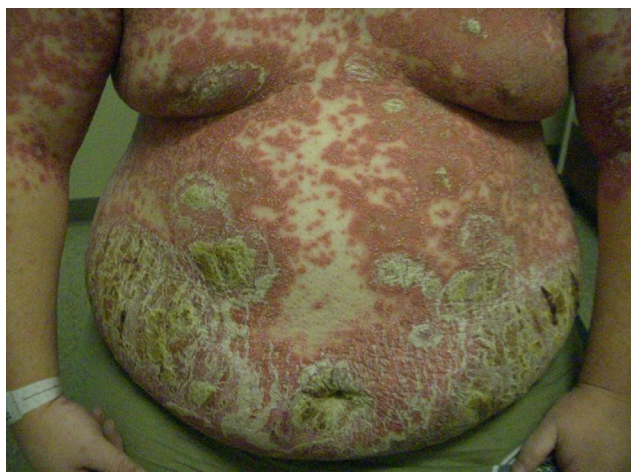
Figure 1 Generalized pustular psoriasis.

Acute GPP is associated with significant morbidity and in some cases, mortality, especially in the absence of appropriate treatment. 16 It is characterized by generalized sterile pustule formation with widespread inflammation and erythema (Figure 1). The pustules often expand and coalesce, forming lakes of pus. 1 Acute GPP is often associated with systemic symptoms such as fever, chills, malaise, anorexia, nausea, and severe pain. 1,18 Other physical findings may be present with acute GPP, such as subungual pustules and geographic tongue. 1 The systemic nature of the disease is reflected in the laboratory abnormalities found in many patients, including hypocalcemia and hypoalbuminemia, as well as in the possible presence of polyarthralgias and neutrophilic cholangitis-induced cholestasis. 19,20