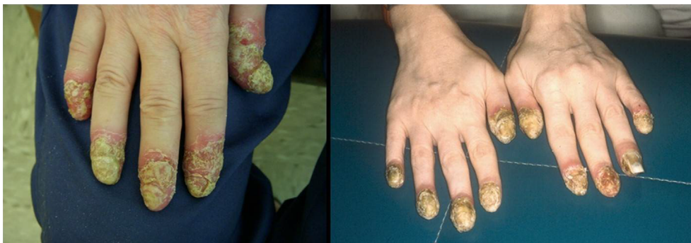
Figure 3 Acrodermatitis continua of Hallopeau.

Evidence-based treatment strategies for ACH are lacking due to the difficulty in diagnosis of ACH and the lack of knowledge regarding the pathophysiology and etiology of the disease. Future management of ACH requires larger controlled studies and further studies on the pathophysiology of the disease, which will likely guide the development of new and effective medications for treatment.