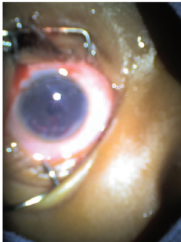
Figure 3 Eye after extracapsular surgery.