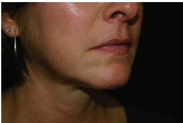
Figure 3 24 hours after Juvéderm™ Ultra to right Marionette line.

The longevity of Juvéderm™ Ultra is about 6–9 months and Ultra Plus may last up to 12 months, which is similar to Restylane® and Perlane®. Captique® and Prevelle Silk® are thought to last 4–6 months and the duration of Puragen® is unknown at the time of publication of this article. Both Juvéderm™ products are packaged in 0.8-mL syringes as a clear gel and are stored at room temperature with a shelf-life