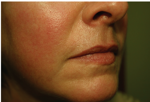
Figure 2 Before Juvéderm™ to the Marionette lines.

completely hydrated with water in the syringe, and HA is well known to be able to bind 1,000 times its weight in water, Juvéderm™ will absorb water after injections and thus slightly expand within 24 hours after correction. The patients can thus be informed, that the effect will be “even better” 24 hours after the injection. However, it is important to consider this feature in clinical practice, especially when injecting the body of the lips, therefore one should always undercorrect to allow for expansion. Restylane® and Puragen® are also not completely hydrated in the syringe, whereas Captique®, Hylaform®, and Prevelle® are completely hydrated and will not expand after injection.