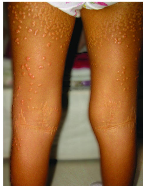
Figure 2 Xanthomas present on the extensor surface of the buttocks and thighs.

Ocular ultrasonographic examination in 20 children with ALGS found optic disk drusen in 90%. Retinal pigmentary changes are also common (32% in one study). 15 Although