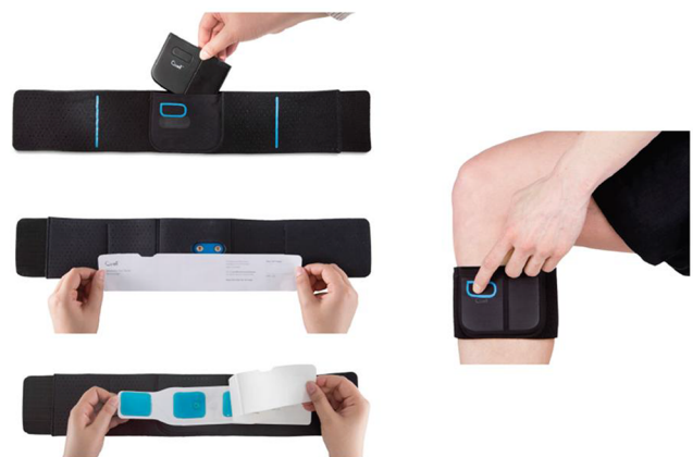
Figure 1 FS-TENS device.

All participants used the same FDA cleared OTC FS-TENS device (Quell ® ; NeuroMetrix Inc., Waltham, MA, USA). This device is comprised of a one-channel stimulator, a stretchable band to secure the stimulator to the upper calf, and an electrode (Figure 1). The electrode is an array of four hydrogel pads, connected in two pairs that provide a 60 cm 2 stimulation surface area. When located on the upper calf, the electrode array is circumferential and will stimulate sensory dermatomes S2-L4 independent of rotational placement. The stimulator generates bipolar, symmetrical, current-regulated pulses with alternating leading phase polarity. The stimulation pulse has zero net current flow to prevent development of polar concentrations with extended use that may cause adverse skin reactions. 37,38 The peak output voltage and current are 100 V and 100 mA, respectively. The phase duration scales from 100 to 200 \mu sec with the stimulation intensity. The inter-pulse intervals vary randomly such that the simulation frequency has a mean of 80 Hz with a uniform distribution between 60 and 100 Hz. High-frequency stimulation induces