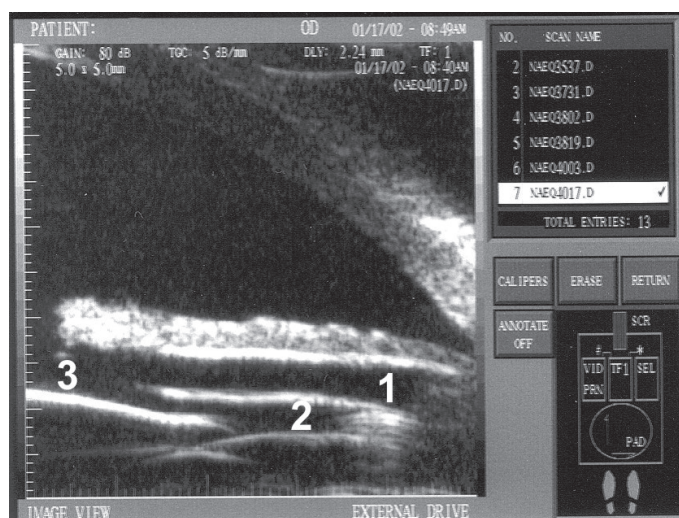
Figure 2 UBM findings after CTR and IOL insertion (intraoperative zonulolysis over 4 clock hours) (Fries et al 1998).

A weakness of the present study is the retrospective nature and the lack of a control group. Obviously, only a prospective randomized study could further elucidate whether the same clinical outcome (eg, possibility of PCIOL implantation) could be achieved without prior implantation of a CTR. However, the following aspects should be considered in this context: First, based on our study with a frequency of CTR implantation of 0.7%, the number of cataract cases included will have to be very large to achieve statistical power. Second, the decision whether to implant a CTR or not is usually made during surgery; this approach interferes with a prospective randomized study setting. Third, patients would have to give their informed consent prior to surgery allowing for the randomized (non-) use of a CTR even in the event of