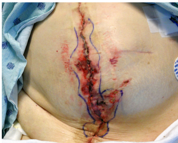
Figure 1 Example of a superficial site infection with necrotic margins.

Early identification of SSIs begins with careful history and physical examination. The majority of these, excluding SSIs involving implants, are diagnosed after discharge, but within 3 weeks from the operation. 64 For superficial SSIs, margins of the site should be marked in order to more readily observe signs of progression (Figure 1). 10 When presenting with systemic signs of infection, wound/tissue and blood samples for gram stain, culture, and susceptibility should be obtained and will help guide therapy. 2 Furthermore, any drainage should be