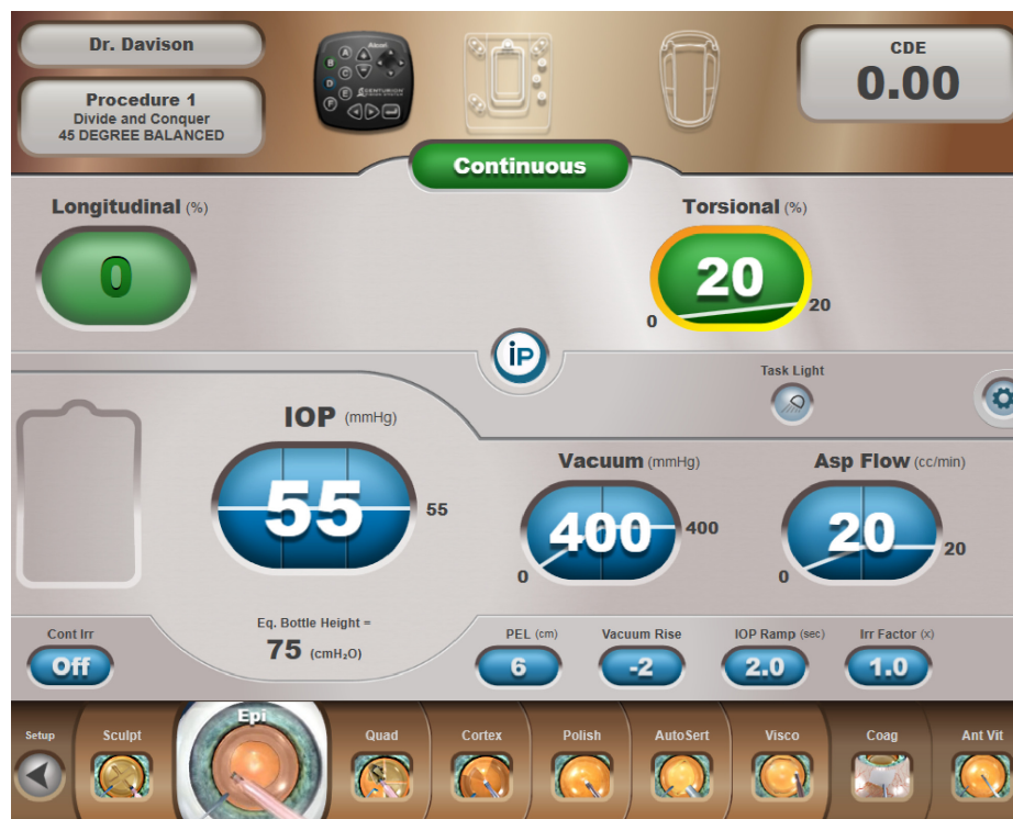
Figure 4 The machine panel display of the Epinucleus Removal Setting (Epinucleus Removal Step Button enlarged in the procedure step toolbar) shows linear control of vacuum and aspiration flow in foot position 2, which becomes fixed at their maximums in foot position 3 when linear control of continuous torsional amplitude becomes available. The iP feature is engaged but does not come into play in soft cataracts. The Epinucleus Removal Setting procedure step button is between the Sculpt and Quadrant Removal procedure step buttons in the procedure step toolbar along the bottom of the display.

The surgical technique is most appreciated when applied to cataracts graded LOCS III NO and/or NC 3.6 or less but is employed in firmer lenses as well. Relatively narrow grooves are sculpted into the nucleus using the sculpt setting (Figure 5), sometimes after using an Akahoshi pre-chopper, Ambler Surgical, Exton, PA, USA to create four quadrants (LOCS III NO or NC 3.5 or less). The distance from the tip's aperture from the capsule, and the low vacuum and aspiration flow, make inadvertent capsule aspiration unlikely. Better visualization of the tip's cutting edge on the progressively thinner posterior nuclear plate is created by turning it into an oblique position with the aperture away from the surgeon (Figure 6A). Tearing of the posterior nuclear plate from peripheral to central is facilitated using the same tip orientation. The tip is then rotated approximately 90° to achieve a different oblique orientation where the aperture is toward