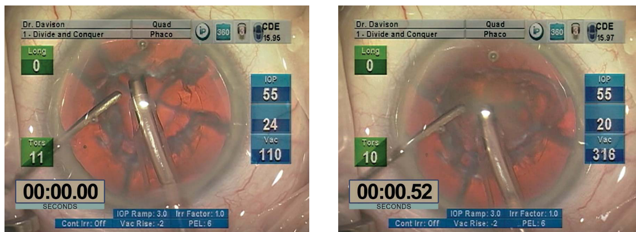
Figure 7 Removal of the second and subsequent quadrants of relatively firm soft lenses using the Quadrant Removal Setting.

Notes: With the timer set at 0 seconds (left) the second quadrant is about to be engaged using the quadrant removal setting. 0.52 seconds (right) later the tip aperture and second quadrant have been centralized. Nuclear material is being aspirated with high vacuum, intermediate aspiration flow, and minimal torsional tip movement.