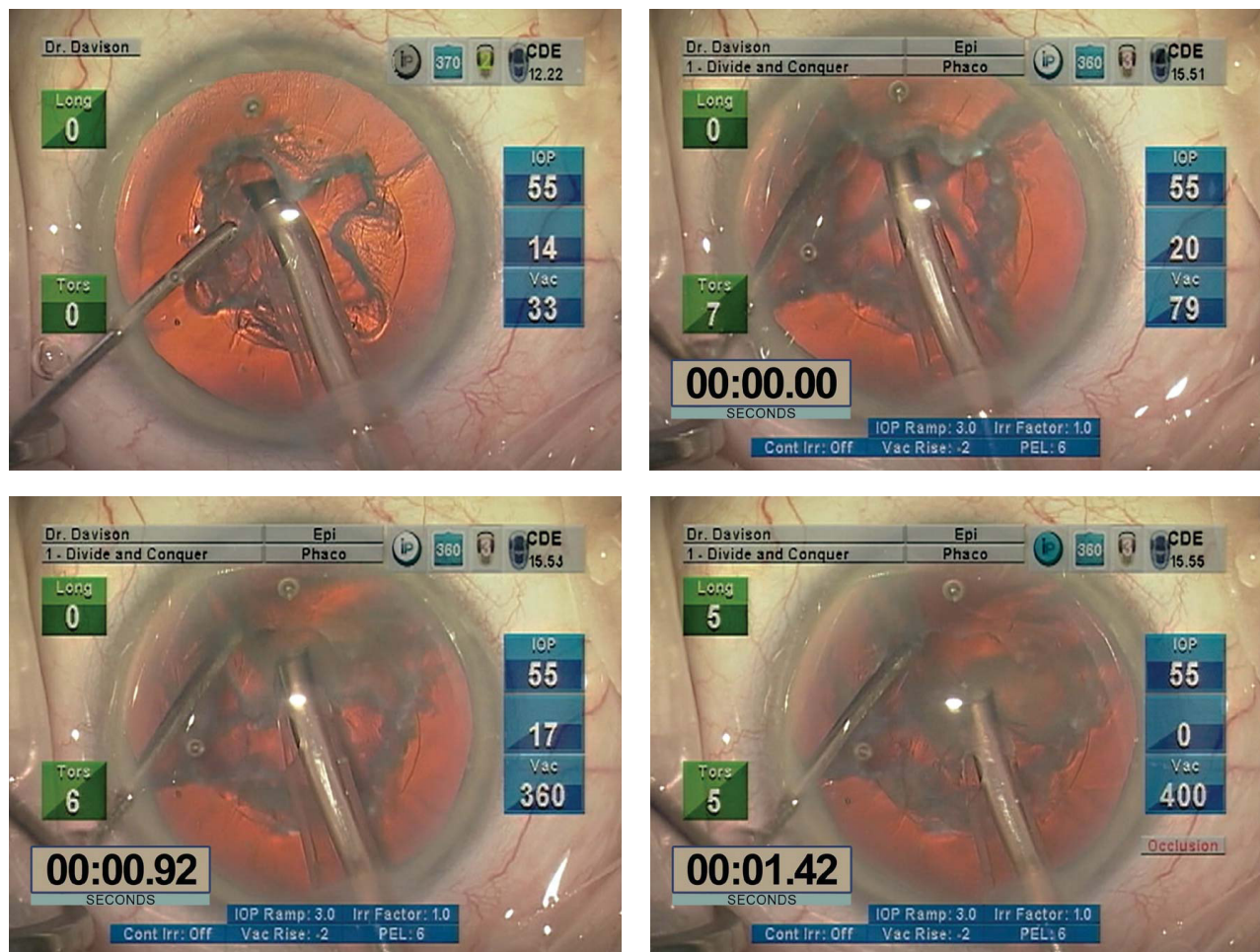
Figure 6 Soft cataract technique using the Epinucleus Removal Setting.