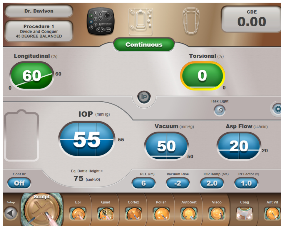
Figure 5 The machine screen display of the Sculpt Setting (Sculpt Procedure Step Button enlarged in the procedure step toolbar) shows low fixed values for vacuum and aspiration flow and linear control of continuous longitudinal tip motion.

Note: These parameters provide just enough vacuum and flow to aspirate the mix of nuclear dust in balanced salt solution.