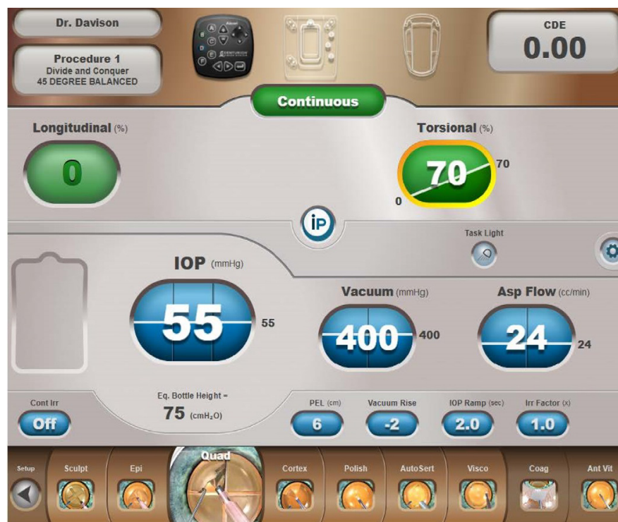
Figure 1 The machine panel display of the Quadrant Removal Setting (Quadrant Removal Step Button enlarged) in the procedure step toolbar shows a -2 vacuum rise with linear control (angled line) of torsional amplitude.

Notes: Vacuum and aspiration flow parameters are fixed (horizontal line) with moderate value maximums for foot position 2 (left side of vertical line) and 3 (right side of vertical line). A target IOP of 55 mmHg is the equivalent of a gravity feed bottle height of 75 cm and has been selected for all three foot positions. The iP (Intelligent Phaco) feature is engaged with 10 msec longitudinal pulse duration, 95% vacuum threshold, and 1.0 longitudinal/torsional ratio.