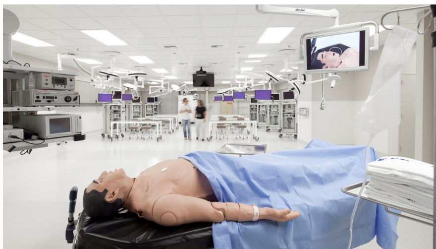
Figure 5 High fidelity mannequin in a state-of-the-art simulation facility.

developing brain. 68–70 Initial research demonstrated harm to the brains of young animals. 71–74 This raised concern that young children might also be at risk when exposed to anesthetic agents. 75 Following the publication of these concerning findings, human studies were initiated. 76–79 The results have often revealed conflicting conclusions, with some showing long-term deficits in learning and behavior while others have not. 80 This is a difficult area of study, because children who receive sedation and anesthesia commonly have pathologic conditions for which they require surgery. They may therefore be fundamentally distinct from their healthy peers. Adverse neurologic outcomes are also difficult to recognize