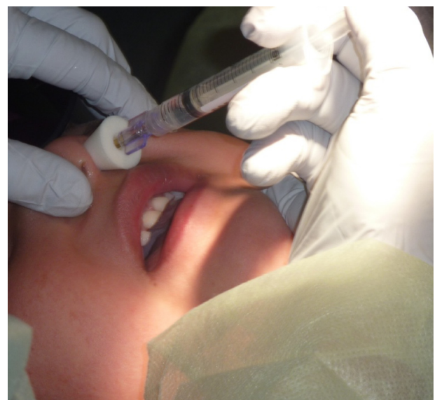
Figure 2 Child receiving intranasal midazolam using an aerosolization device.

Nasal mucosal secretions can also affect intranasal drug absorption. The buccal mucosa has a rich blood supply and is relatively permeable, yielding pharmacokinetics that are similar to intranasal administration. It therefore appears to be an attractive alternative to the intranasal route. 38 Buccal administration of aerosolized midazolam has been proven to be safe, effective, and well accepted by young patients. 28,39,40 An oral solution may also be used in place of aerosol spray; however, the possibility of experiencing the bitter taste increases, leading to poor patient acceptance. 40 Buccal and intranasal midazolam have the same maximum working time while intranasal has a faster onset time. Intranasal midazolam also elicited less crying and produced a greater proportion of patients with optimal sedation scores. 41 Chopra et al and