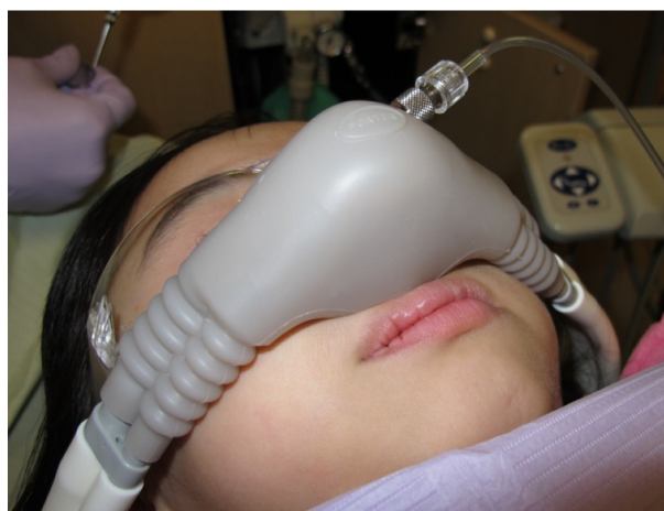
Figure 1 Nitrous oxide nasal hood modified for use with an end-tidal carbon dioxide sampling line.

In response to growing safety concerns, E_tCO_2 monitoring is now used increasingly in ambulatory settings 17,18,20,25 (Figure 1). Professional association guidelines reflect this trend, and the American Society of Anesthesiologists has amended its standards for basic anesthetic monitoring to require E_tCO_2 for moderate or deep sedation. 25 In dentistry, perhaps the most widely recognized professional sedation guidelines come from the American Dental Association. For children 12 years of age and under, the American Dental Association recognizes the American Academy of Pediatrics/American Academy of Pediatric Dentistry (AAP/AAPD) guidelines for monitoring and management of pediatric patients during and after sedation for diagnostic and therapeutic procedures. Both the American Dental Association and the AAP/AAPD guidelines suggest that E_tCO_2 monitoring may