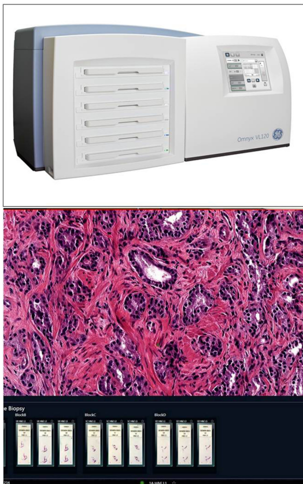
Figure 1 (Top) Omnyx whole slide imaging scanner. (Bottom) Omnyx viewer and integrated digital pathology solution that facilitates pathologist workflow.

The aim of this article is to review the technology and demonstrate the use of WSI for various clinical and non-clinical uses in pathology. Emerging issues related to clinical validation of these digital imaging systems and recent advances in the field are also addressed.