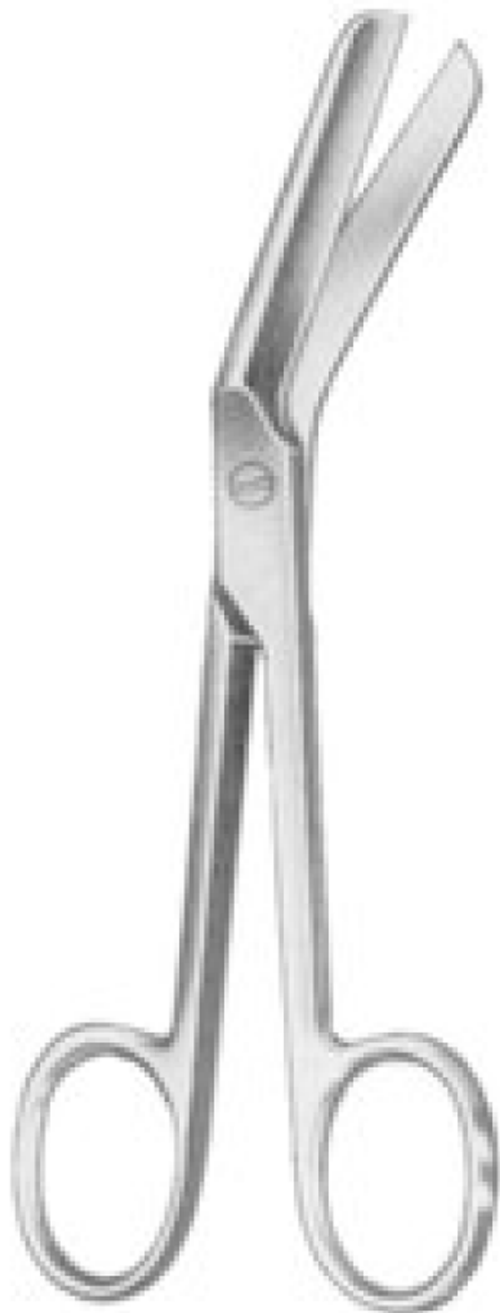
Figure 1 Braun-Stadler episiotomy scissors.

Traditionally, the Braun-Stadler (BS) episiotomy scissors have been used worldwide. The blades are angled to the side by about 15 degrees (Figure 1). The EPISCISSORS-60® (E60) (Medinvent LLC, Romsey, United Kingdom) are angled-on-flat scissors with a guide-limb that points toward the anus. It is claimed to cut at 60 degrees if the guide-limb is aligned to the anus (Figures 2 and 3).