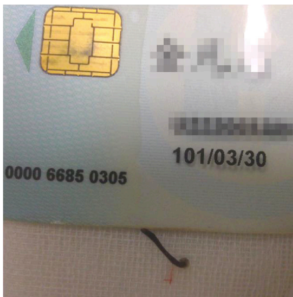
Figure 2 The removed leech.

Note: The two suckers at each end and the midbody segments can be observed.