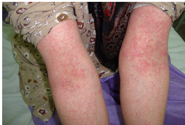
Figure 1 A 25-year-old woman with the diagnosis of acute generalized exanthematous pustulosis following the use of cephalexin.

In patients with a diagnosis of fixed drug eruption induced by trimethoprim-sulfamethoxazole (34 patients), most lesions were present in the genital area (18 patients). Five patients had lesions in both the genital area and the lip, and only one patient suffered from a lesion present only on the lip. The remaining patients had lesions in other areas,