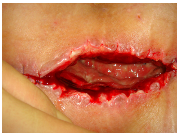
Figure 2 After surgical debridement and before VAC application. Abbreviation: VAC, vacuum-assisted closure.

Of the TLIF patients, 65.9% were female, and all of the patients with surgical site infections were female. At our clinic, the incidence of surgical spinal infection after open TLIF and posterior instrumentation was 1.89%. The mean age of the infected patients was 55.6 (range 49–62) years. Comorbidities included diabetes, chronic renal failure, alcohol abuse, obesity, malnutrition, rheumatoid arthritis, and smoking. All patients underwent the same procedure (TLIF plus posterior fusion with instrumentation) in the lumbar spinal region as the index operation (Table 1). A combination of superficial and deep drains was used in the primary procedure in all cases. The average surgery time was 2.1 (range 1.8–3) hours. The infection presented a mean of 14 days after surgery. Overall, an average of 5.1 (range 3–8) debridement and irrigation procedures was performed before