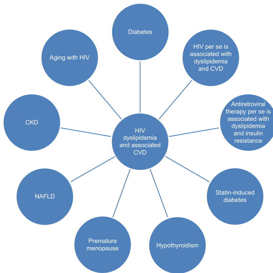
Figure 1 Illustration of different potential factors that lead hyperlipidemia with HIV and associated increase in risk of CVD.

Patients infected with HIV have a higher prevalence of thyroid dysfunction when compared with the general population. In view of the fact that hypothyroidism is associated with hyperlipidemia, the focus of this section is on the prevalence of hypothyroidism with HIV. Importantly, ART can complicate thyroid function through drug interactions and the immune reconstitution inflammatory syndrome. 56 The prevalence of hypothyroidism in HIV patients in France was found to be around 16%, and low CD4 cell counts and administration of stavudine were risk factors. 57 While in Thai patients, the